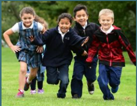
Community of Saints (West St. Paul, MN)

The HealeyEd Talk E-Roundtable series delivers best practices on Catholic schools governance. By exploring timely topics and inviting experts to share their opinions and approaches, the series encourages and supports Catholic schools nationwide in taking charge of their own futures.